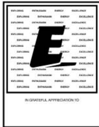
Exploring Certificate, No. 33144A